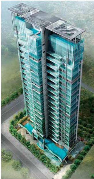
Suites @ Cairnhill