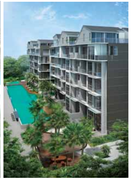
The Foresta @ Mount Faber

Established since 1983, Hoi Hup Realty Pte Ltd is a well-established property developer based in Singapore.