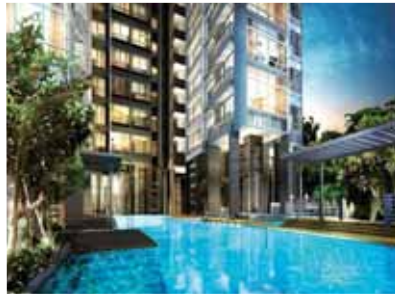
Residences @ Killiney